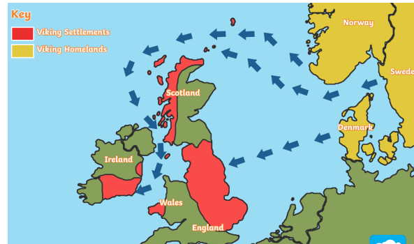
Viking invasions shown on a map