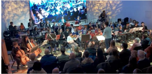
The Autumn 2025 Primary Orchestra performing at the Winston Churchill School Autumn Concert