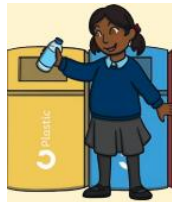
put litter in the bin