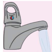
turn off taps

Previous Knowledge – knowledge of materials and what things are made from, knowledge of living things in our world