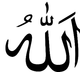
The symbol for Allah