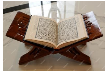
The holy book – The Qur'an

Muslims believe it contains the words of Allah given to Muhammad by the Angel Jibreel